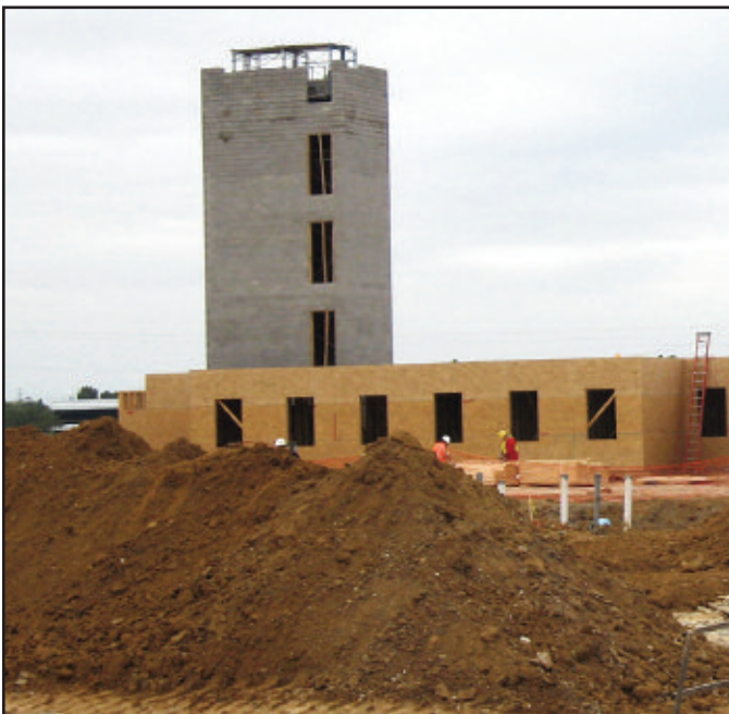
The first floor and the tower for the stairs, Oct. 1, 2008