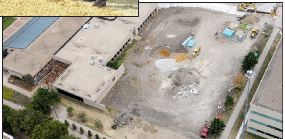
The beginning of construction of the Dining Hall at the Student Union