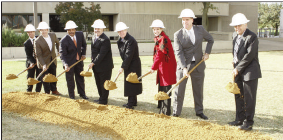
Ground-breaking ceremony for the new Math, Science, Engineering Teaching (MSET) Center on Oct. 28, 2008