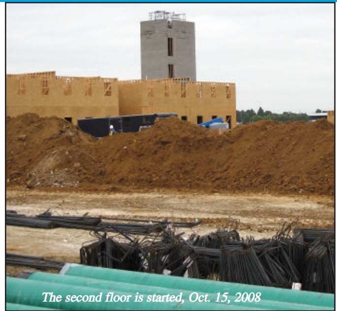
The second floor is started, Oct. 15, 2008