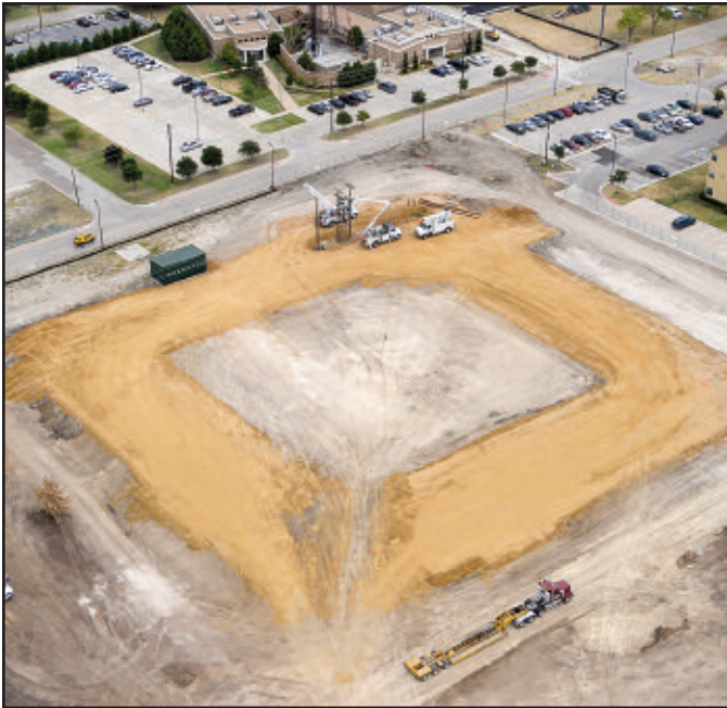
The cleared site of the Student Housing Living-Learning Center, Sept. 1, 2008