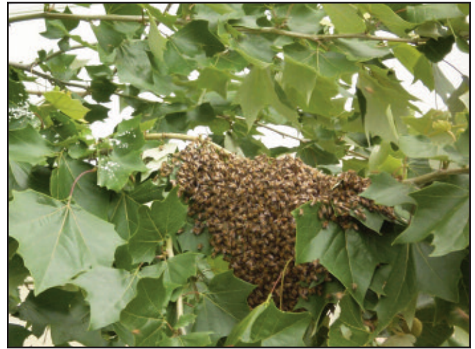
Swarm of bees found outside the School of Management Building by University Police who arranged to have the bees removed without exterminating them.

First class to complete manager certification.