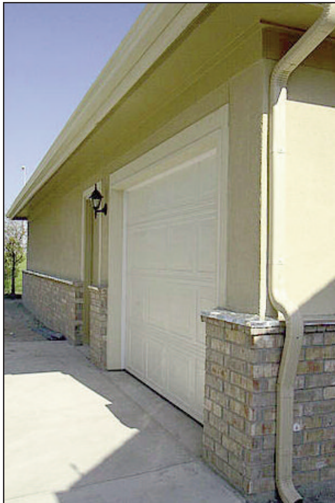
New Housing Maintenance Building at the University Village Apartments

If you have not yet used your 2008 floating holiday, try to do so before August 31. If you cannot use your floating holiday this fiscal year, it will be carried forward like a day of annual leave. Contact Human Resources Management for more information about holidays at UT Dallas.