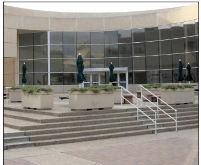
New picnic tables and planters outside the Cecil and Ida Green Center.