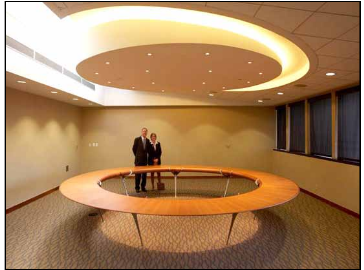
Calatrava Table in McDermott Suite