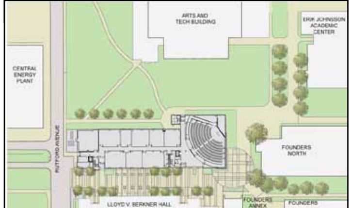
MSET plans and view of construction site