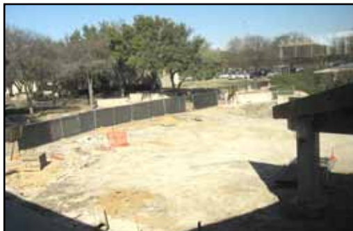
Left & below: Campus enhancement between the Student Union and McDermott Library Right: Campus enhancement plans