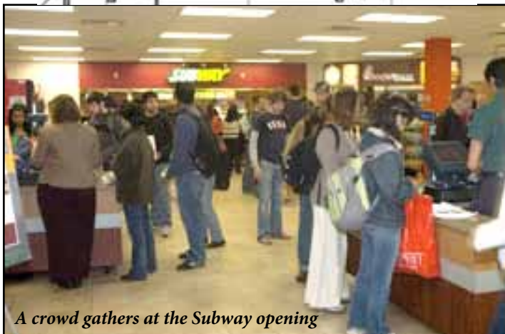
A crowd gathers at the Subway opening