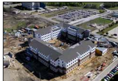
New Student Housing and Living Learning Center

You only need to venture out across campus in any direction to encounter a barricade, a “Do Not Enter” sign, or even a newly-constructed fence standing in the way of your destination. Indeed, the record amount of transformational activity has generated challenges with the ability to get from point A to point B. There is an enormous amount of excitement and energy associated with what the campus will resemble in the next 24 months. With no fewer than six major projects underway, we are creating a campus that all will be extremely proud to claim as our UT Dallas. The new residence hall and dining facilities are scheduled for completion in August 2009. The campus enhancement project, which will dramatically change the entrance and mall of the campus, is scheduled for completion in December 2009.